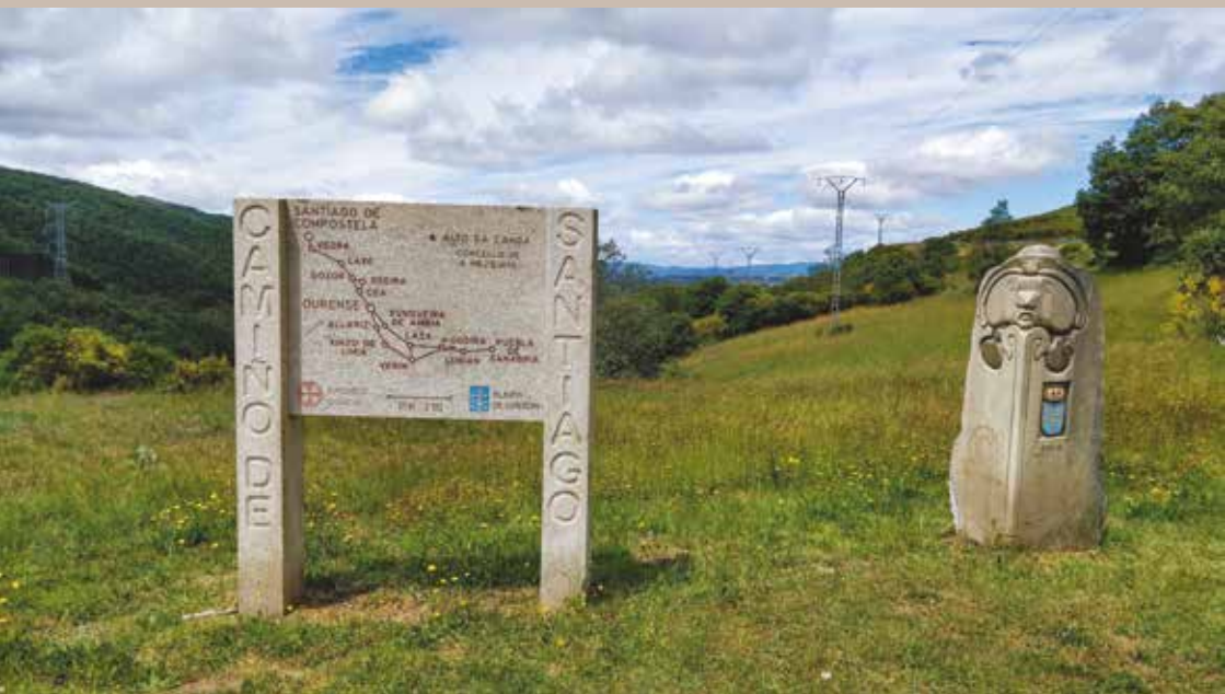
Alto de A Canda. Border between the provinces of Zamora and Ourense (A Mezquita). Entrance to Galicia on the Mozarabic Way - Vía de la Plata