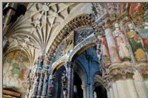
Portico of Paradise in the Cathedral of Ourense

The Portico of Paradise in the Cathedral of Ourense is one of the temple's most remarkable monumental ensembles. It was inspired by the one built by Master Mateo in Santiago, although the Ourense Portico was completed later, in the 13th century . The most recent restoration, finished in 2013 , revealed a stunning polychromy on the figures of the apostles and prophets.