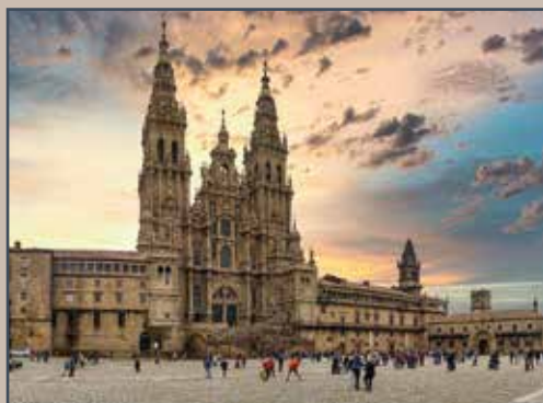
Cathedral of Santiago

If you begin your Camino in Ourense , your journey starts and ends at a Portico . One hundred kilometers separate the two most famous Porticos in Galicia — or, in other words, one hundred kilometers separate Paradise , in Ourense, from Glory , in Santiago.