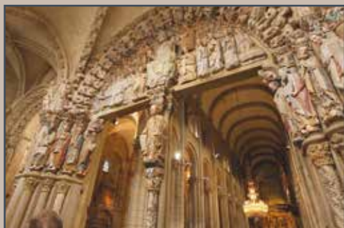
Portico of Glory in the Cathedral of Santiago